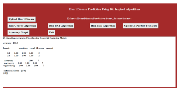
Fig.3. Genetic Algorithm Accuracy.

open empty windows, u just close all those empty windows except current window