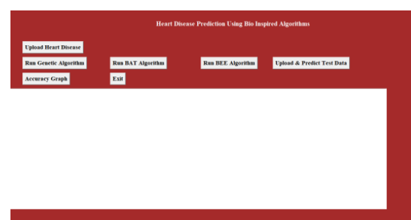
Fig.1. Home page.

The results obtained after executing the implementation code is shown from Fig.1 to Fig.9. To run this project double click on 'run.bat' file to get below screen