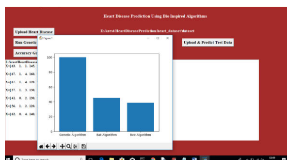
Fig.5. Accuracy Graph.

In above screen for BAT we got 45% accuracy, now click on 'Run BEE Algorithm' button to get BEE accuracy.